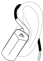
CORRECT cable over-the-ear and earphone flush in the ear

Incorrect wear will result in poor fit and sound!